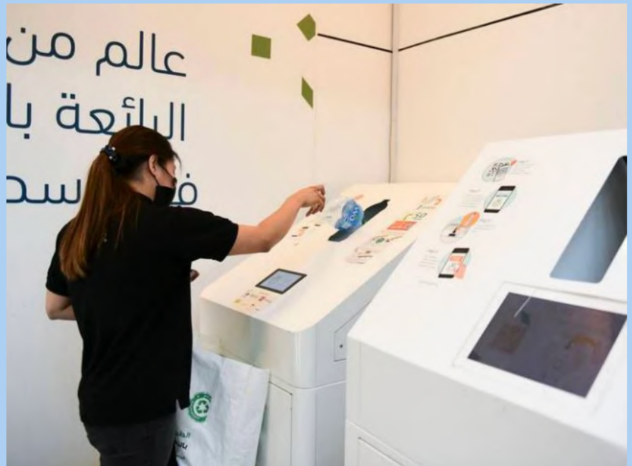
Example of one-stop shop for sorting, shredding and injection moulding plastic.

Thor Sverre Minnesjord CEO, Cycled Technologies