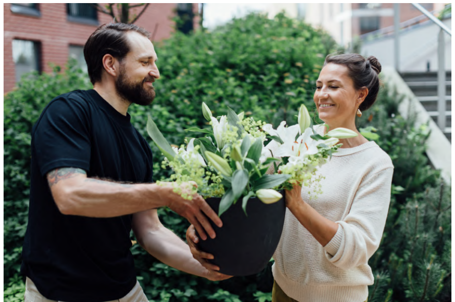
Nefco approved financing for eight of Nopef's past and current client companies in 2022 to scale up Nordic green solutions globally.

Nopef has continued its collaboration with Nefco to promote further financing options for SMEs. Many Nopef clients turn to Nefco to apply for further financing once their plans have proceeded. As a result of this collaboration, Nefco approved financing for eight of Nopef's past and current client companies in 2022 to scale up Nordic green solutions globally. To date, some 70% of clients that have received fast-track loans from Nefco previously conducted a feasibility study with support from Nopef.