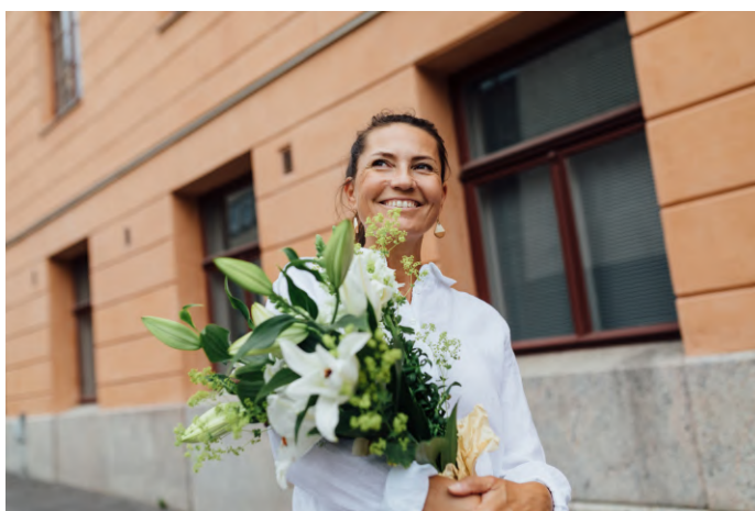
Nopef (the Nordic Project Fund) celebrated 40 years of operations in 2022.

Nopef has been administered by Nefco (Nordic Environment Finance Corporation) since 2014 and is financed through annual budget allocations from the Nordic Council of Ministers. In its operations, Nopef strives to cooperate with other Nordic institutions and agencies that promote exports and innovation in the Nordic countries.