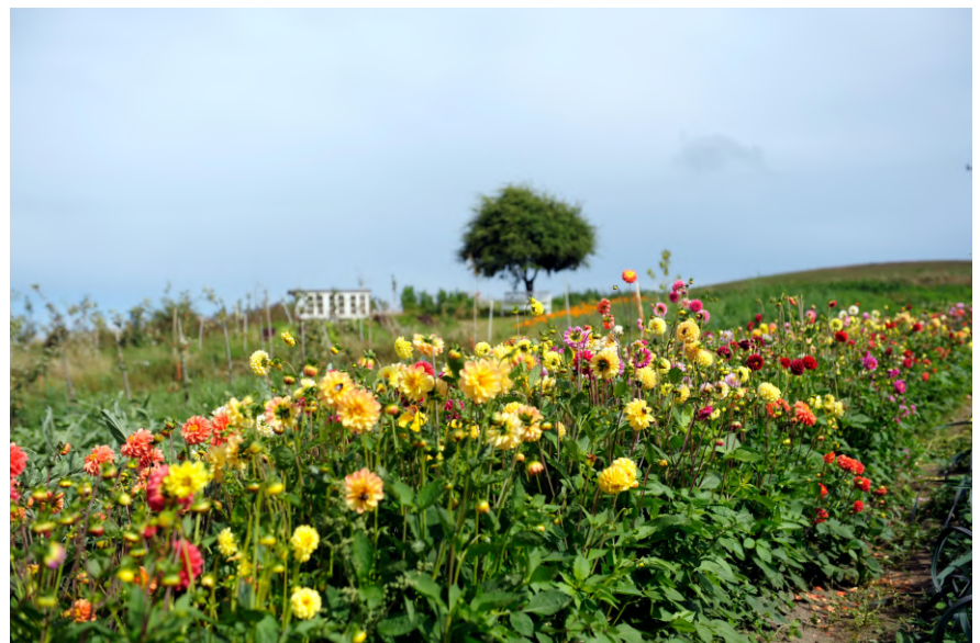
Nopef's environmental mandate was introduced in 2014, when Nefco took over as the fund manager.

Nopef's environmental mandate was introduced in 2014, when Nefco took over as the fund manager. However, green growth was one of Nopef's key focus areas long before this. Today, Nopef's financing and environmental criteria often serve as a stamp of quality for the projects it supports, helping companies to establish themselves in their target markets.